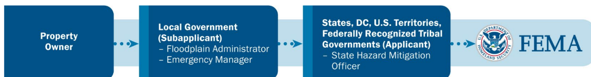
Figure 3: Swift Current Application Process Overview

The local government is considered the subapplicant and will develop a subapplication with any interested property owners. The local government will then submit the subapplication to appropriate state, tribal or territorial government on the property owner’s behalf. Tribal governments applying as applicants will work directly with FEMA to submit their application.