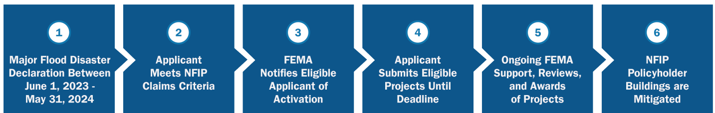
Figure 1: Swift Current Process Overview

Funds will be made available to states, territories, and federally recognized tribal governments that receive a major disaster declaration following a flood-related disaster event and meet all other eligibility criteria. Swift Current is not available to all property owners and aims to provide flood mitigation funding for buildings with a current contract for flood insurance under the National Flood Insurance Program (NFIP) and a history of repetitive or substantial damage from flooding. The total funding available for Fiscal Year 2023 is $300 million, which was made possible through an infusion of dollars by the Infrastructure Investment and Jobs Act (IIJA), better known as Bipartisan Infrastructure Law (BIL). The figure below provides an illustrative overview of the key steps in the Swift Current process.